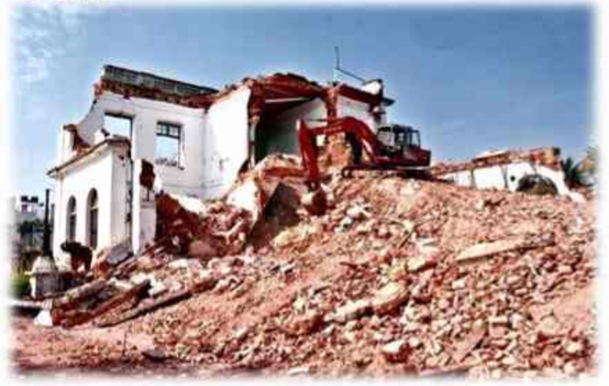
The Heritage Building was Built during 1870